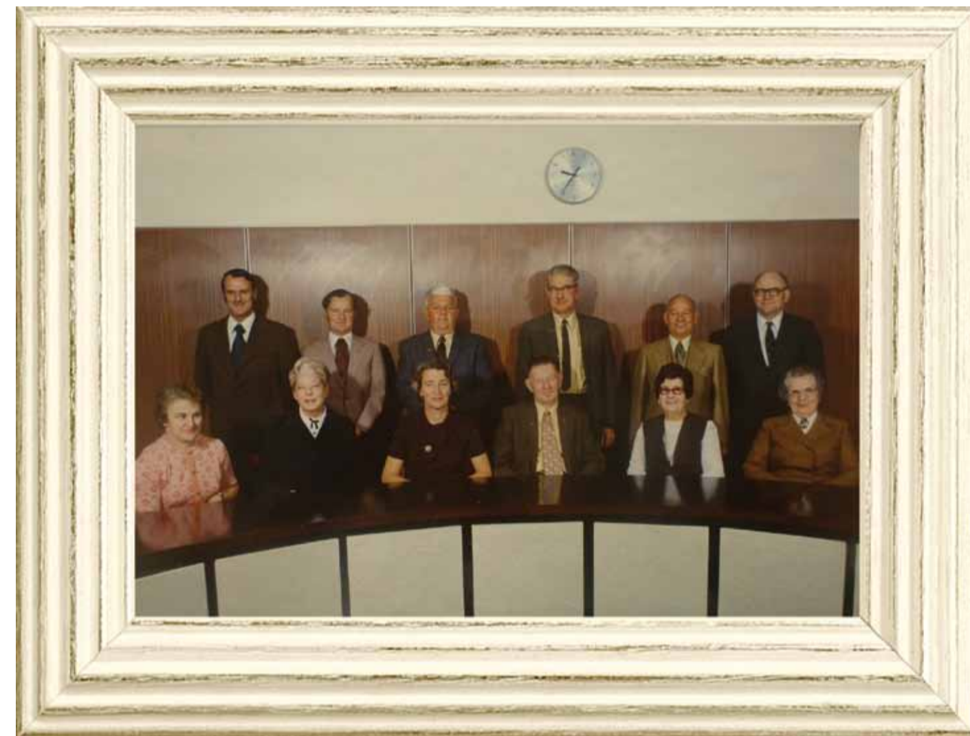
1974 Bay of Plenty Hospital Board