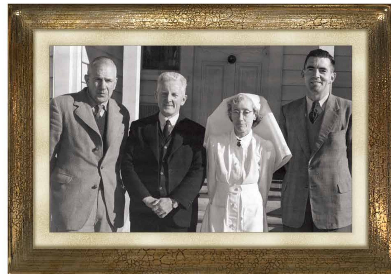
1951 Ōpōtiki Hospital