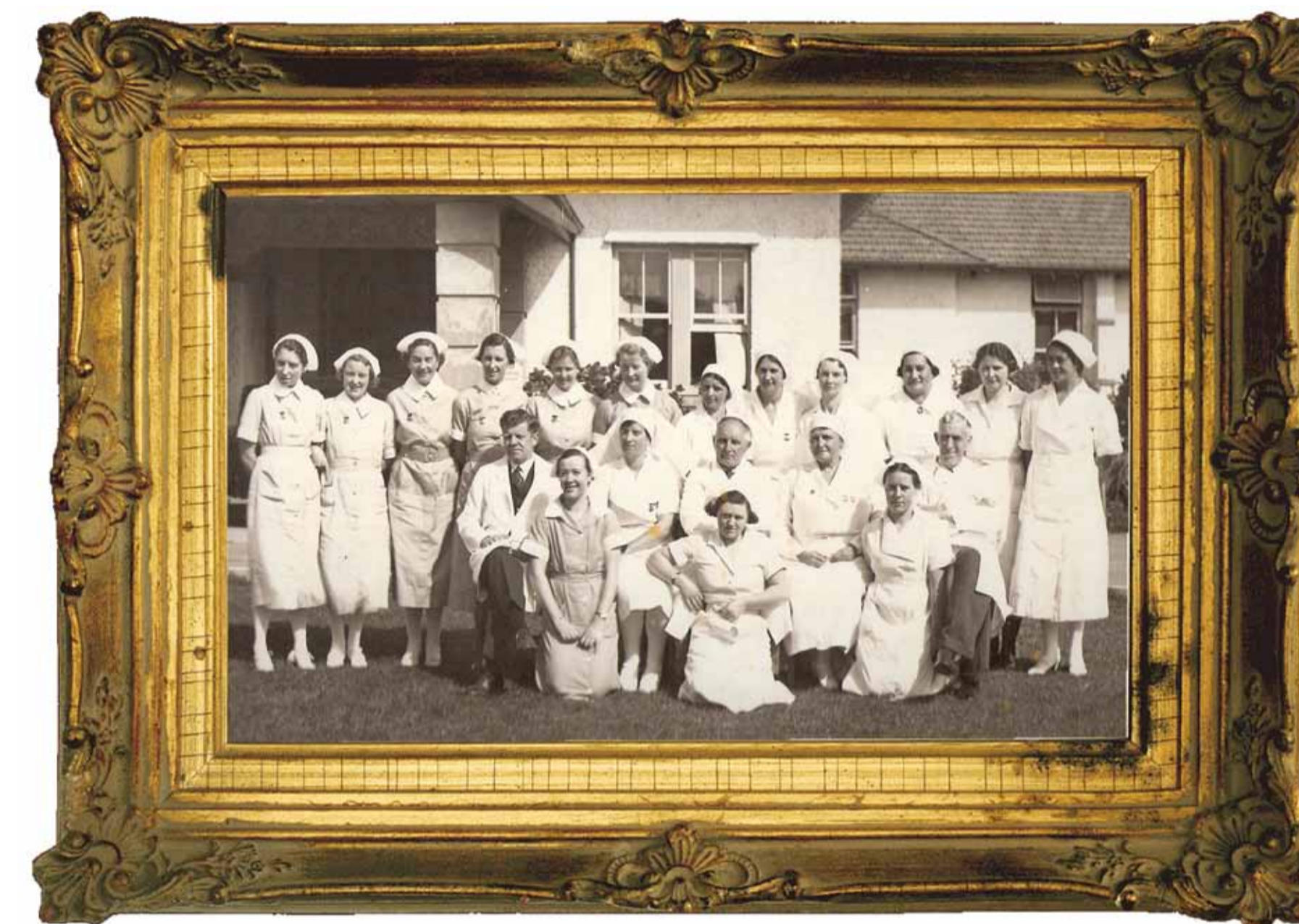
Senior Staff and Nurses Whakatāne Hospital 1937