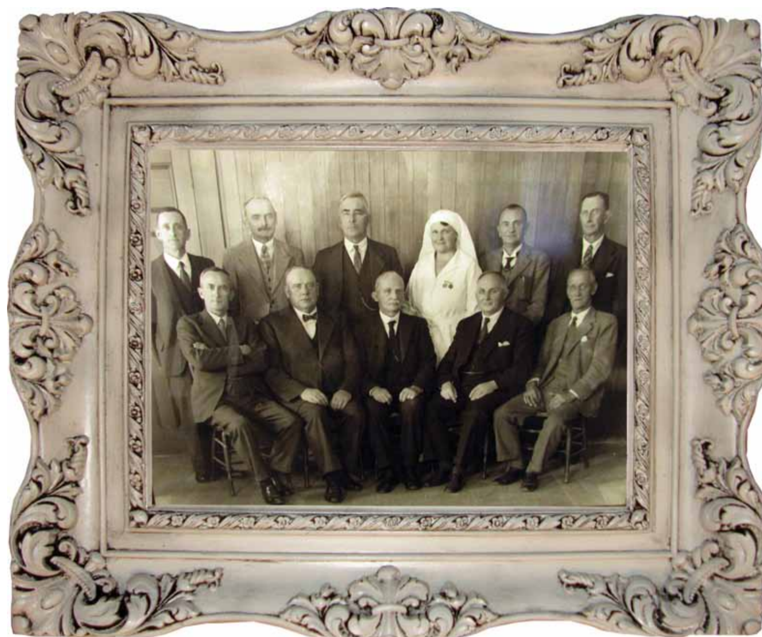
Whakatāne Hospital Board 1936