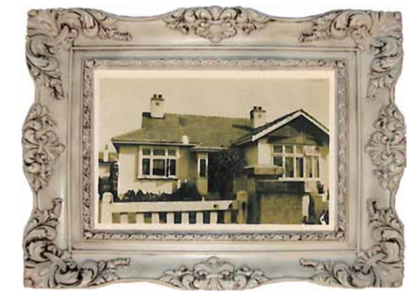
Whakatāne Hospital first Nurses' Home opened July 1928