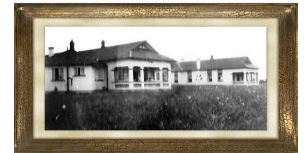
Whakatāne Hospital buildings in 1927