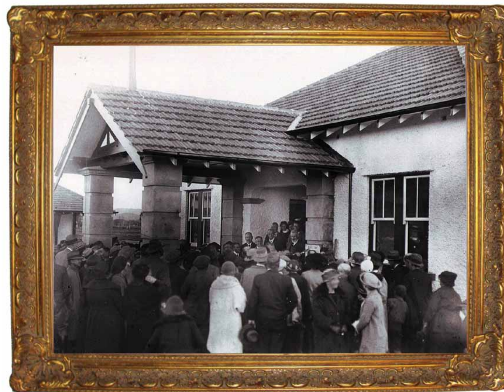
1923 Whakatāne Hospital opening by The Hon Sir Maui Pomare Minister of Health and one of New Zealand's first Māori doctors.