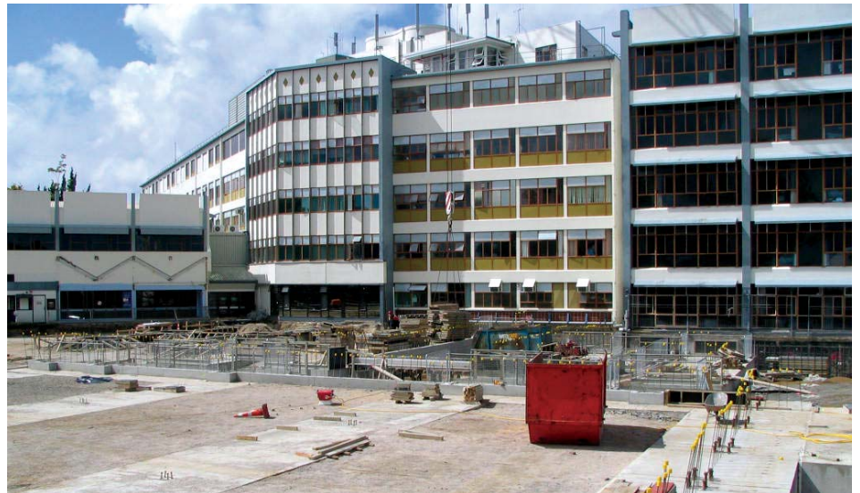
Tauranga Hospital under construction

Meanwhile, foundation work for the north wing ward block and podium buildings will continue throughout February.